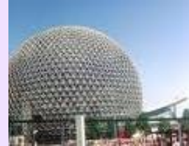
USA Pavilion—Expo 67