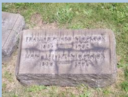
Frank Stockton's grave at The Woodlands Cemetery in Philadelphia